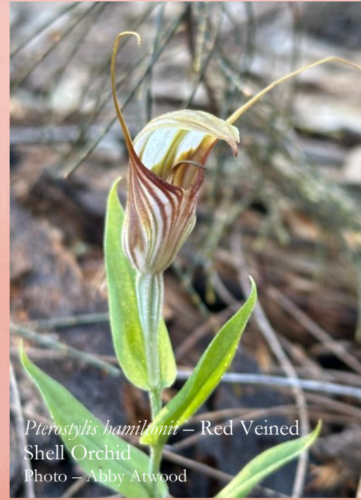
Pterostylis hamiltonii – Red Veined Shell Orchid