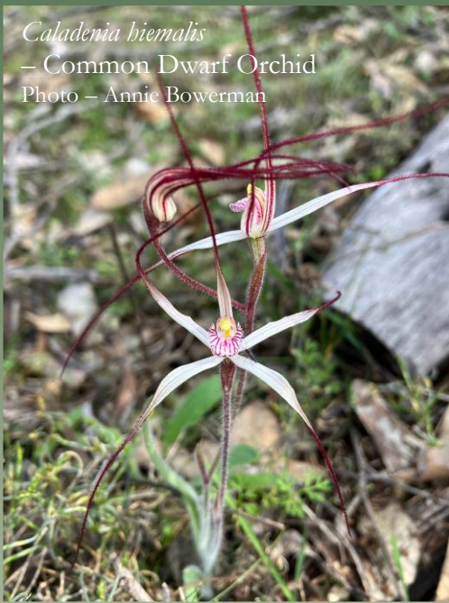
Caladenia biemalis – Common Dwarf Orchid