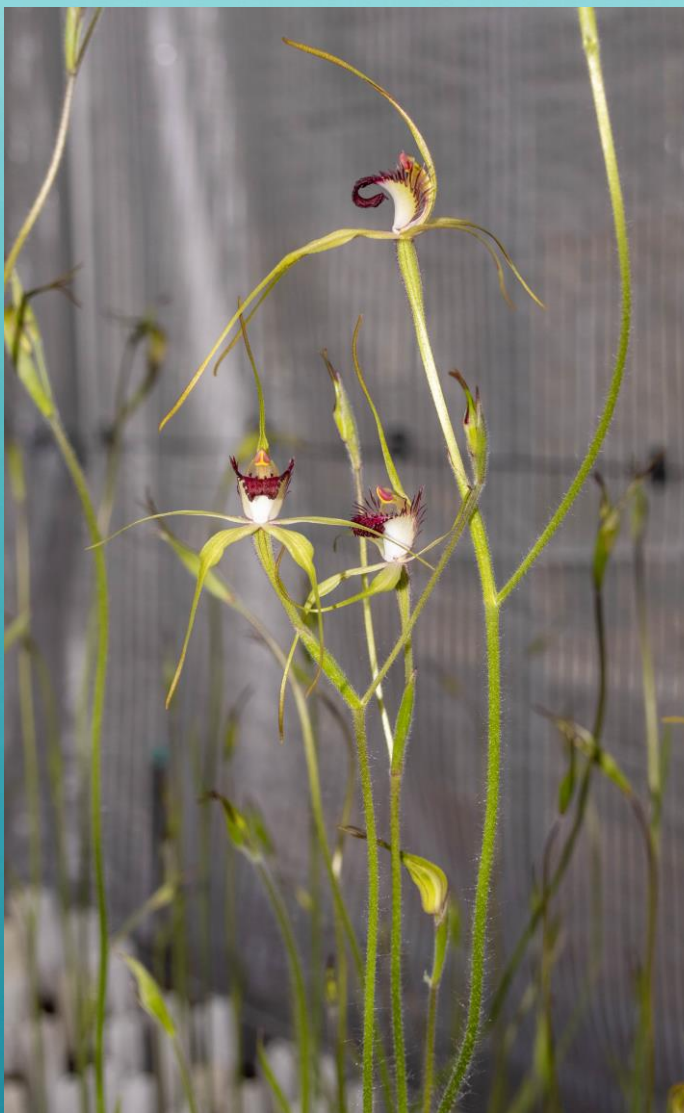
Top right the critically endangered Collie Spider – Caladenia leucochila .