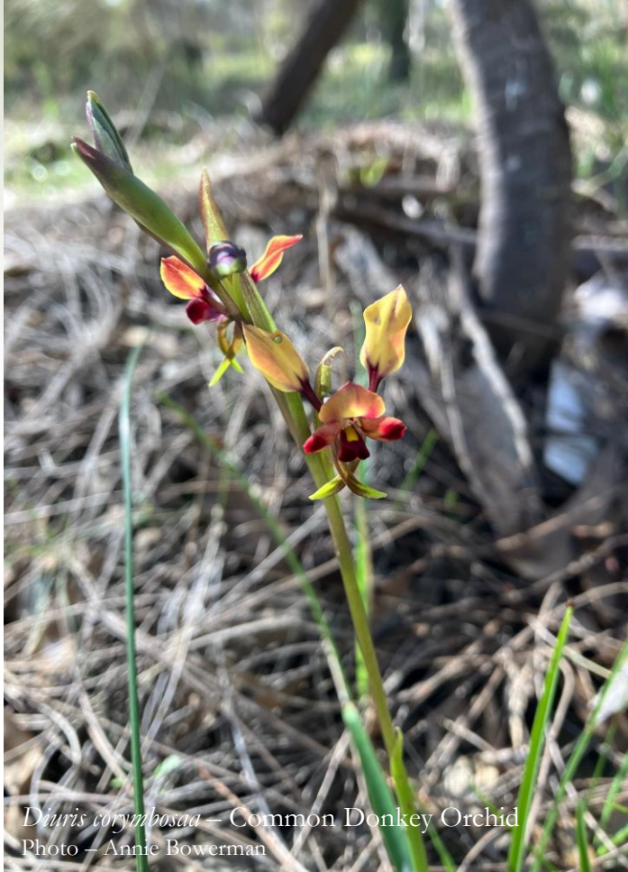
Diuris corymbosaa – Common Donkey Orchid