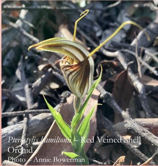
Pterostylis hamiltonii – Red Veined Shell Orchid