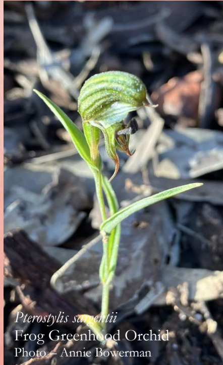
Pterostylis sargentii Frog Greenhood Orchid