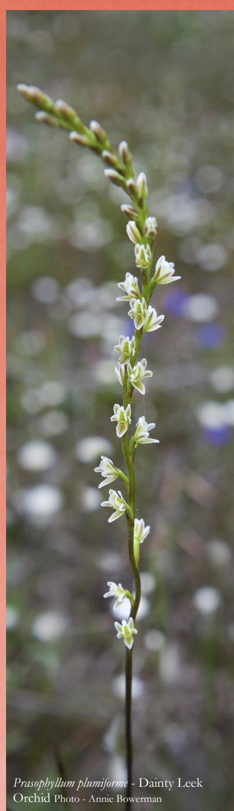
Prasophyllum plumiforme - Dainty Leek Orchid