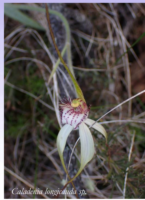
Caladenia longicauda sp.