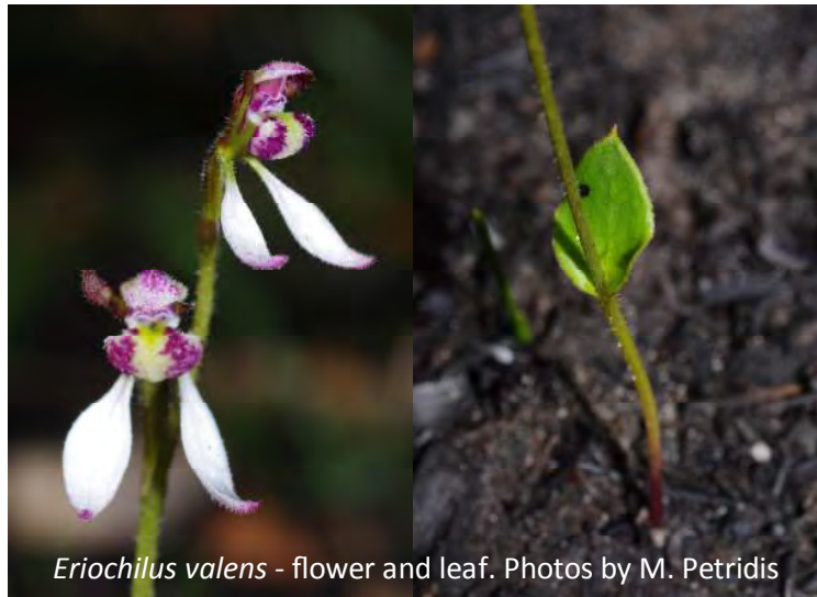
Eriochilus valens - flower and leaf.