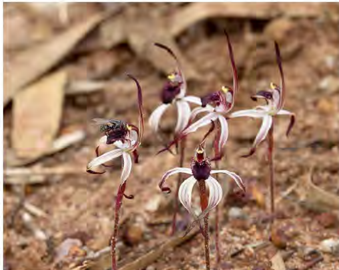
Caladenia drummondii .

Ed: Check http://stuckinthewoods.info/gear/compass.html or talk to Trevor for more advice on use of compass with a rotating bezel.