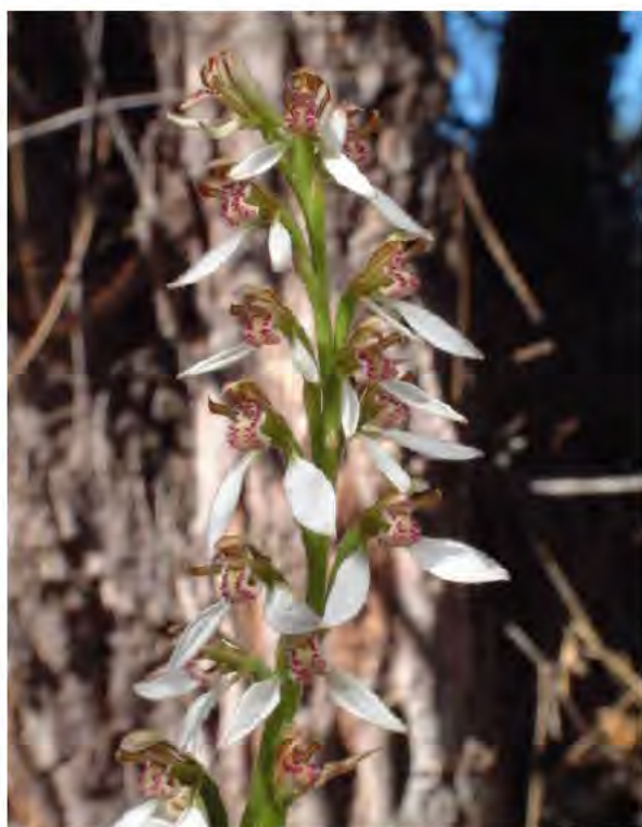
Eriochilus dilatatus subsp. multiflorus (Common bunny orchid).

We all derive immense pleasure from wandering around the bush, sometimes in large or small groups but quite often on our own.