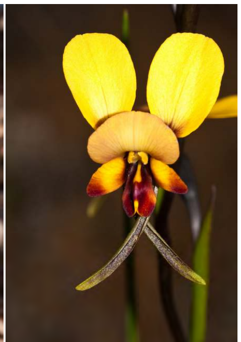
L-R: Pterostylis dilatata, Thelymitra pulcherrima and Diuris perialla —some of the species that will be the focus of the June field trip to Jurien Bay area.