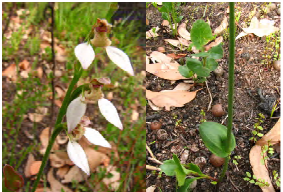
Ross thinks that this might be Eriochilus dilatatus subsp. magnus —flower and leaf.

On our way to Albany we stopped for a cuppa before Glenn Eagle Forest and found our first Eriochilus multiflorus . Then off to Gull Rock Rd with the whole family (great-grandchildren included). There we found some lovely red valens . Granddaughter found 2 Praecoxanthus aphyllus . Then onto Denmark and around several roads and on to Watershed Rd we found lots of P. aphyllus and a lot of different Eriochilus : magnus , pulchella (we think), more valens and lots of tiny little helonomos . So a very successful morning. And still have one more day to go in Northcliffe but that might be a total wash out as it is now pouring rain!