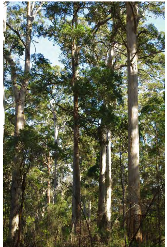
Bush around Northcliffe.

The last suitable Silva brand compass that I purchased 2 or 3 years back was under $30 at that time (from BCF).