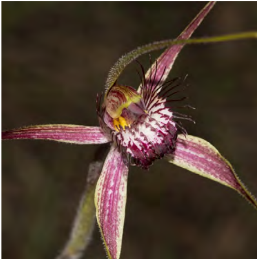
Carousel spider Orchid