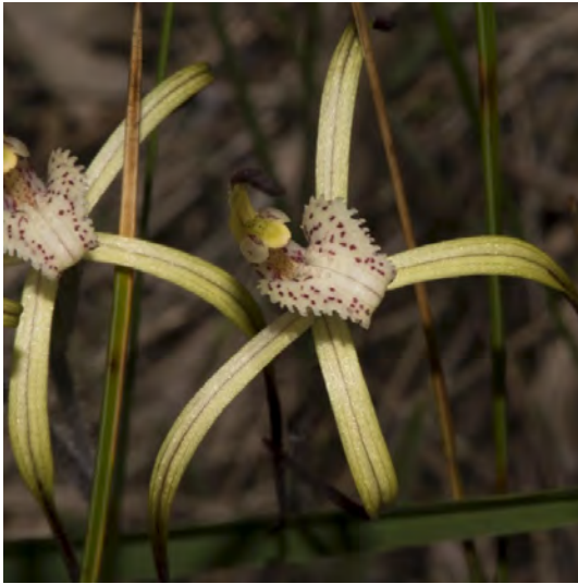
Yellow spider Orchid