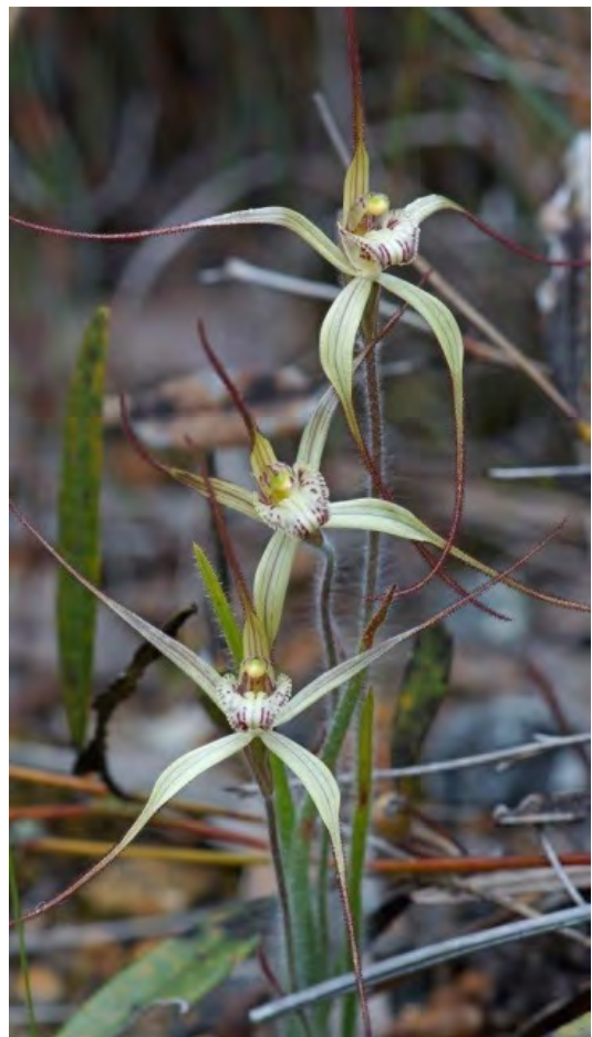
Caladenia fuscolutescens (Ochre Spider)