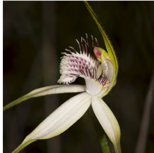
"Jack Eborall" Spider Orchid