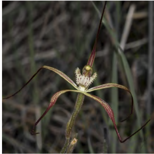
Reddish form of Yellow Spider Orchid