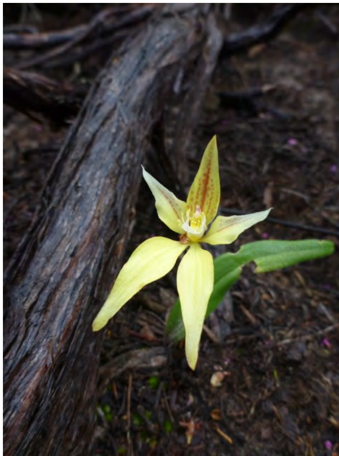
Caladenia flava subsp flava (Cowslip Orchid)