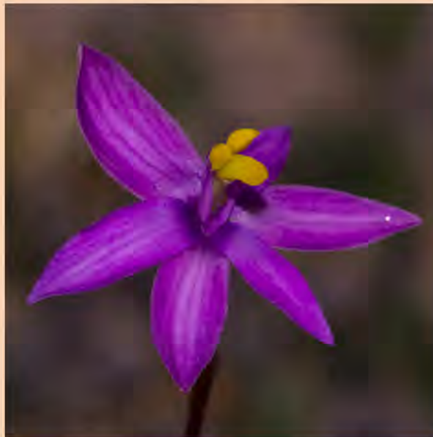
Western Wheatbelt Sun Orchid – Dragon Rocks – Sep 2013

The Western Wheatbelt sun orchid is a hybrid between Thelymitra antennifera and maculata . It was first collected by Fred and Jean Hort in 1997 west of York. One or two variably coloured pink to red flowers distinguished by their rich colouration.