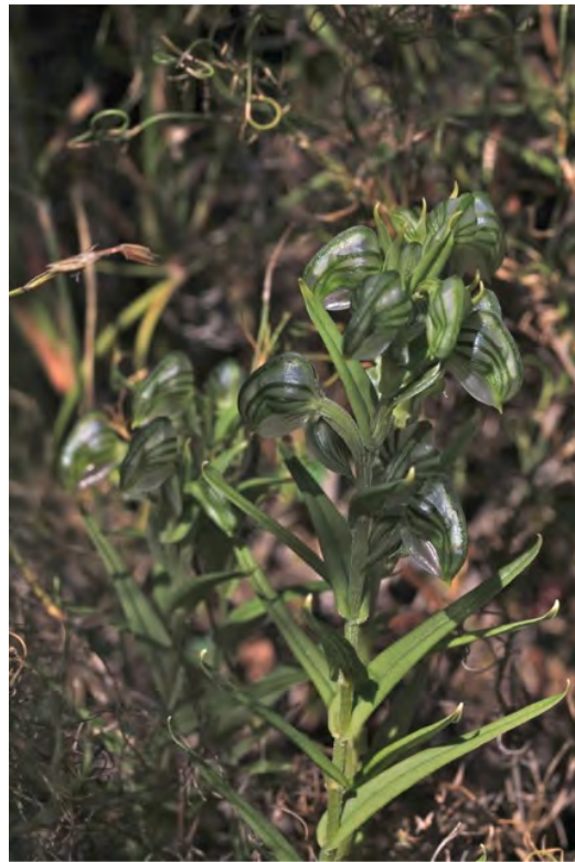
Pterostylis sp south coast (South Coast Banded Greenhood)