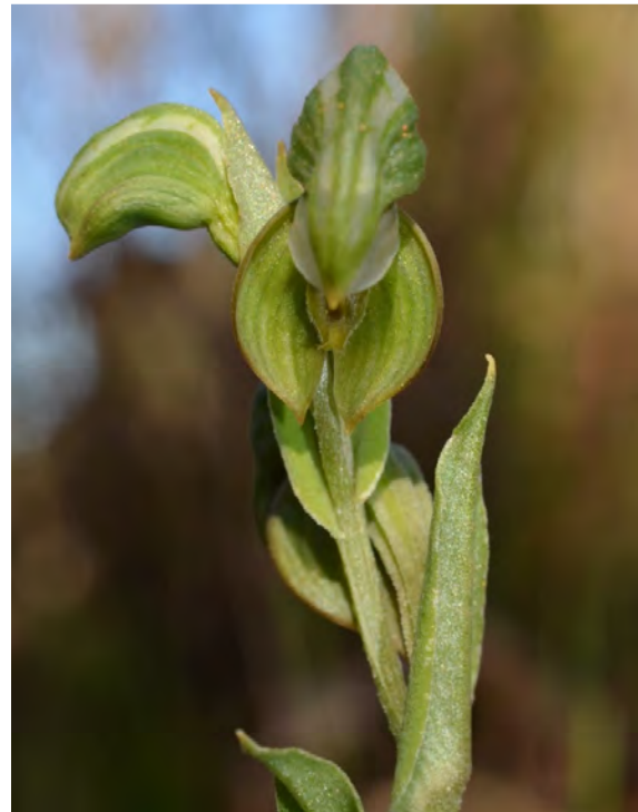
Pterostylis sp coastal (Greenhood Orchid)