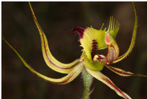
Caladenia falcata (Fringed Mantis Orchid)