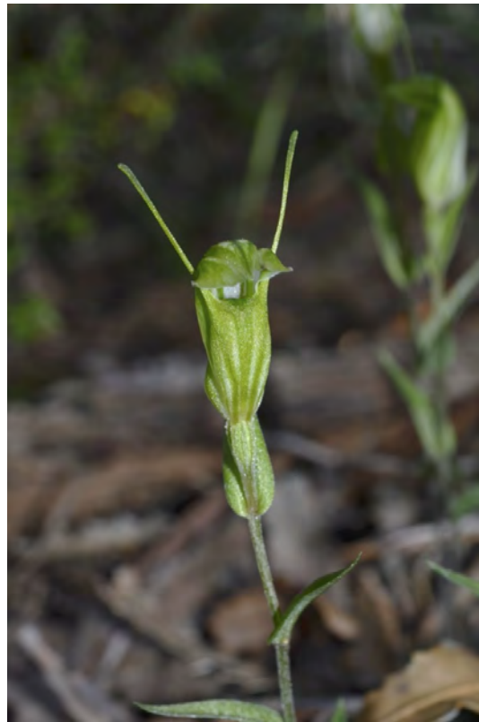
Pterostylis dilatata (Robust Snail Orchid)