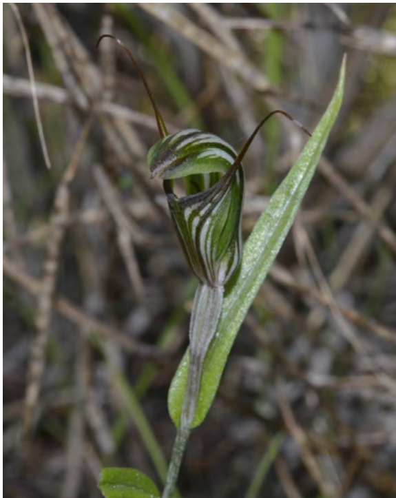
Pterostylis microglassa (Kalbarri Shell Orchid)