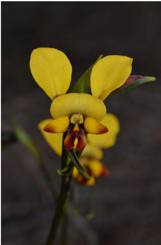
Diuris perialla (Donkey Orchid)