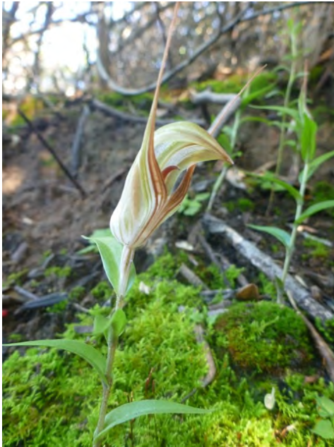
Pterostylis rogersii (Curled-tongue Shell Orchid)