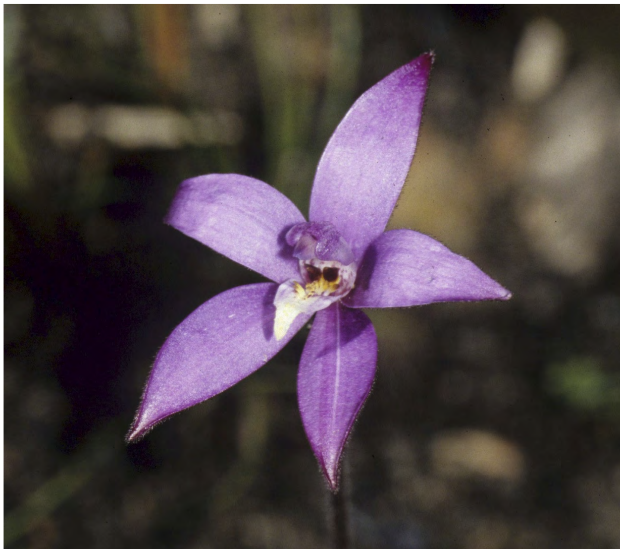
(X) Cyanthera glossodioides