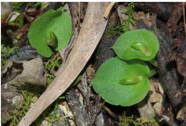
Corybus recurvus (Helmet Orchid)