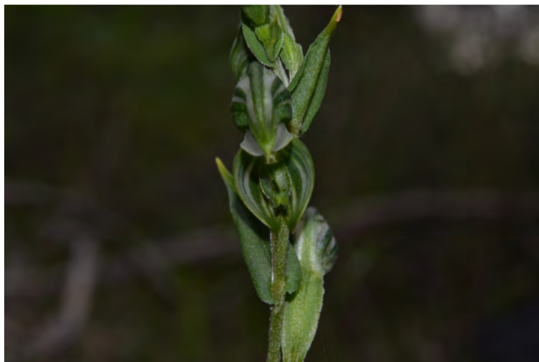
Pterostylis sp. 'Dongara' (Northern Banded Greenhood Orchid)