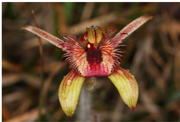
Caladenia discoidea (Antelope Orchid)