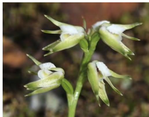
Prasophyllum sp. early (Scented Autumn Leek Orchid)