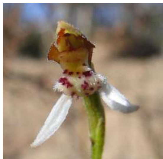
Eriochilus dilatatus subsp. undulatus