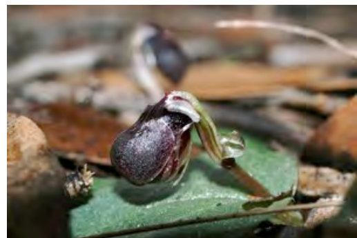
UNGUICUATUS Small Helmet (also known as a Pelican)