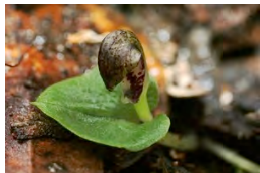
CORYSANTHES DILITATA Hills Helmet Orchid (Note – SA does not have Corybas )