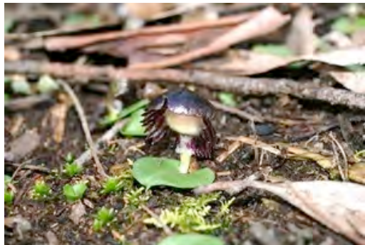
DIEMENICUS Veined Helmet