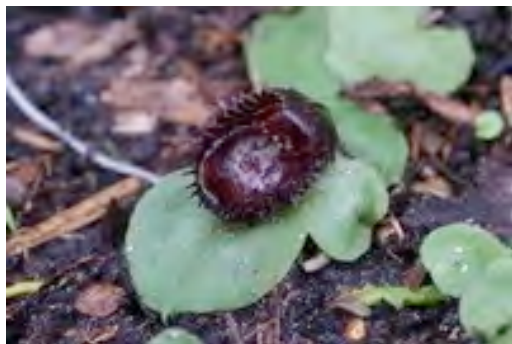
FIMBRIATUS Fringed Helmet