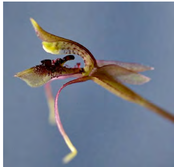
Chiloglotis sp Mango Flats