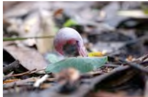
ACONTIFLORUS Spurred Helmet