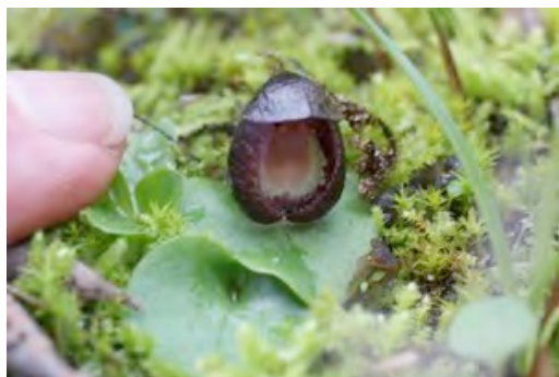
INCURVUS Slaty Helmet