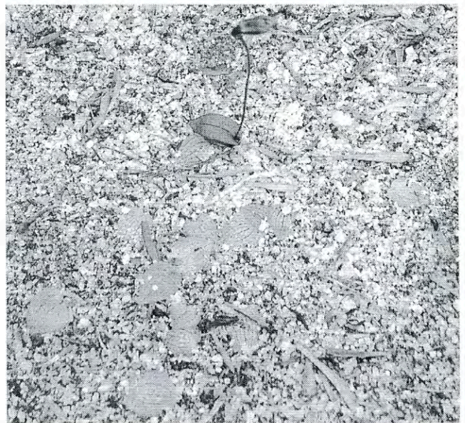
Photograph taken as a record for future monitoring surveys, showing highly distinctive leaves of a large group of Drakaea isolata (with Paraclaeania triens in bud).