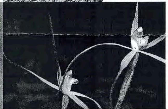
We discovered a new location for the very rare Ballerina Orchid ( Caladenia melanema )!