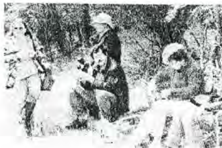
Lunch at Millar Rd

We moved to a second spot along Millar Rd at the end of Johnson Rd in a "Bush Forever" site. We enjoyed lunch and then moved into bushland again finding numerous C. discoidea , flava , latifolia , longicauda ssp calcigena , D. magnifica and one short eared Pt aff nana .