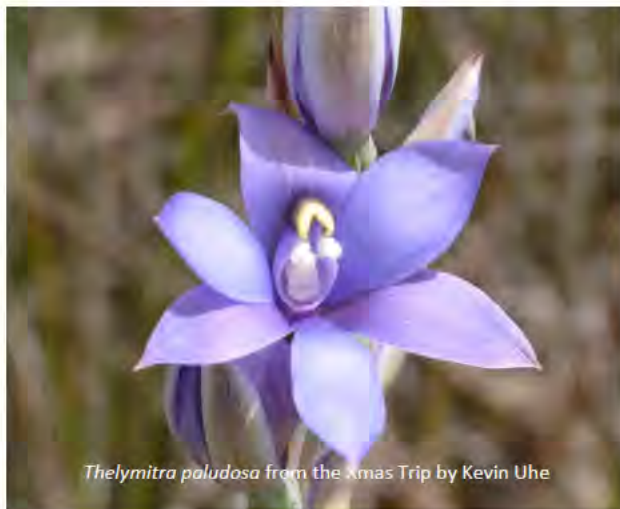
Thelymitra paludosa from the Xmas Trip by Kevin Uhe

AGM CLOSED: 8:10 pm NEXT MEETING: 7:30 pm Wednesday 18 March 2015