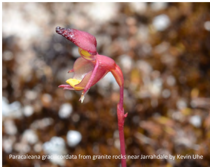
Paracaleana gracilicordata from granite rocks near Jarrahdale by Kevin Uhe