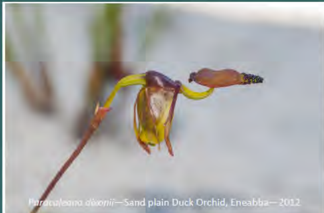
Paracaleana dixonii —Sand plain Duck Orchid, Eneabba—2012