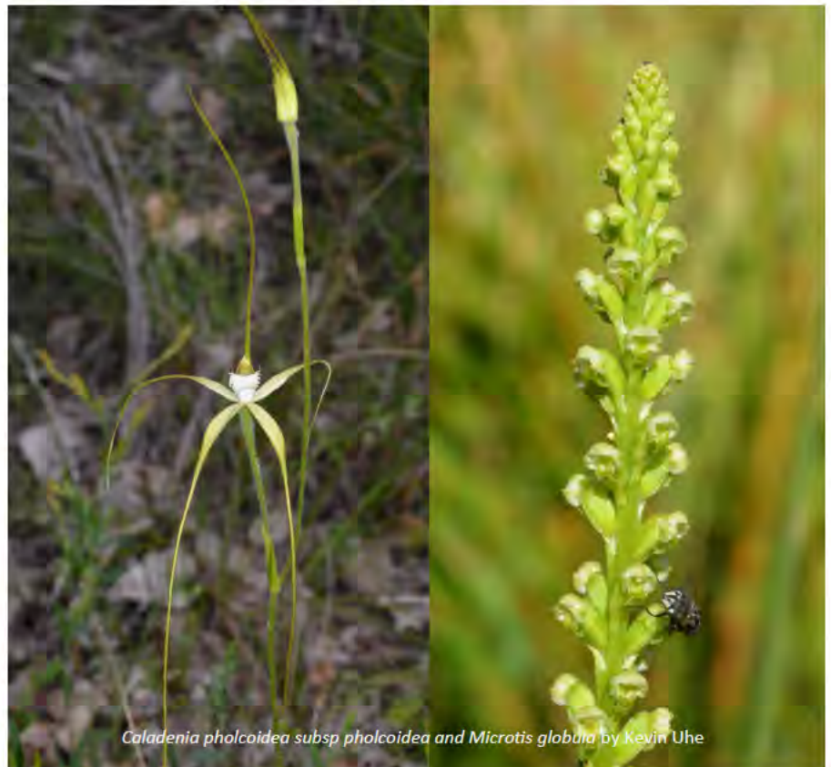
Caladenia pholcoidea subsp pholcoidea and Microtis globula