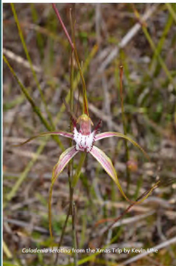
Caladenia serotina from the Xmas Trip