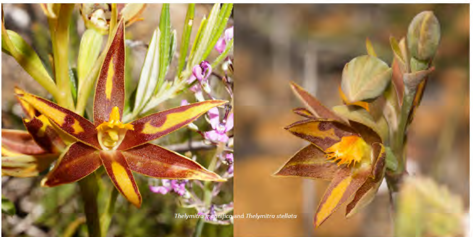
Thelymitra magnifica and Thelymitra stellata