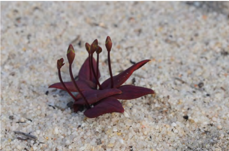
Clockwise: Paracaleana dixonii in bud, plant and habitat