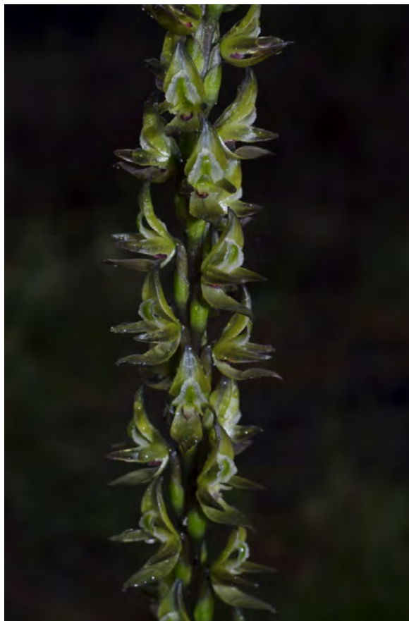
Prasophyllum triangulare – Dark leek orchid