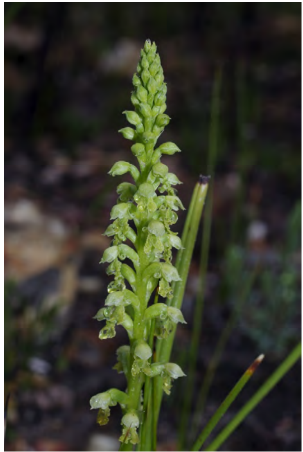
Microtis alboviridis – Scented mignonette orchid