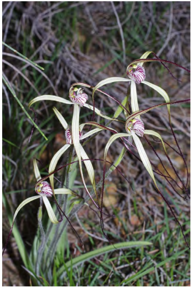
Caladenia sp Brookton Highway