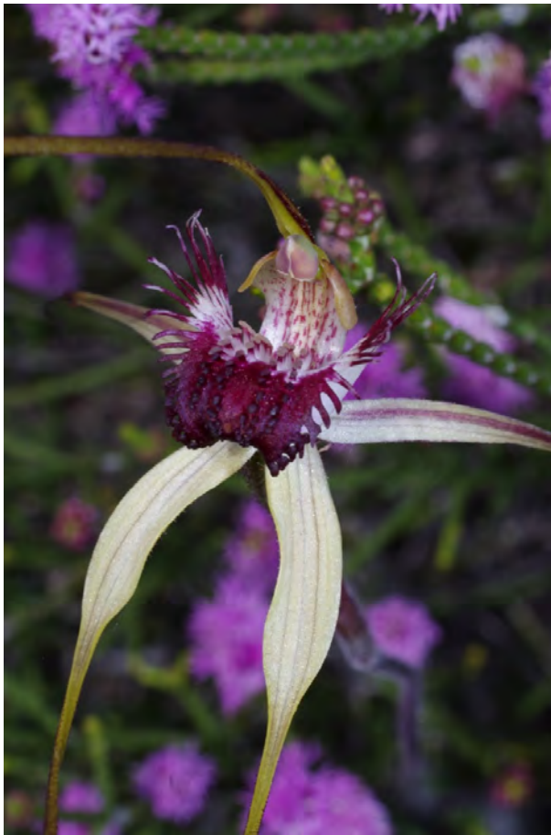
Caladenia heberleana – Heberle's spider orchid