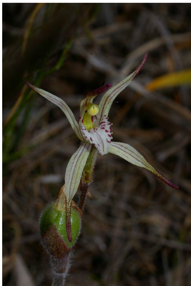
Caladenia bicalliata subsp. bicalliata – Dwarf limestone spider orchid