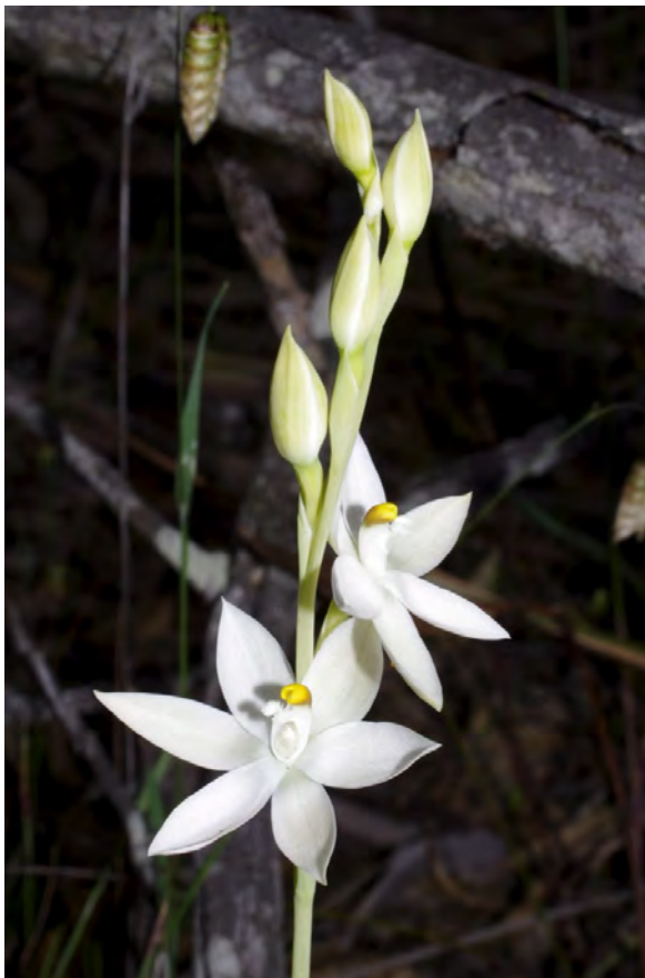
Thelymitra graminea – Shy sun orchid