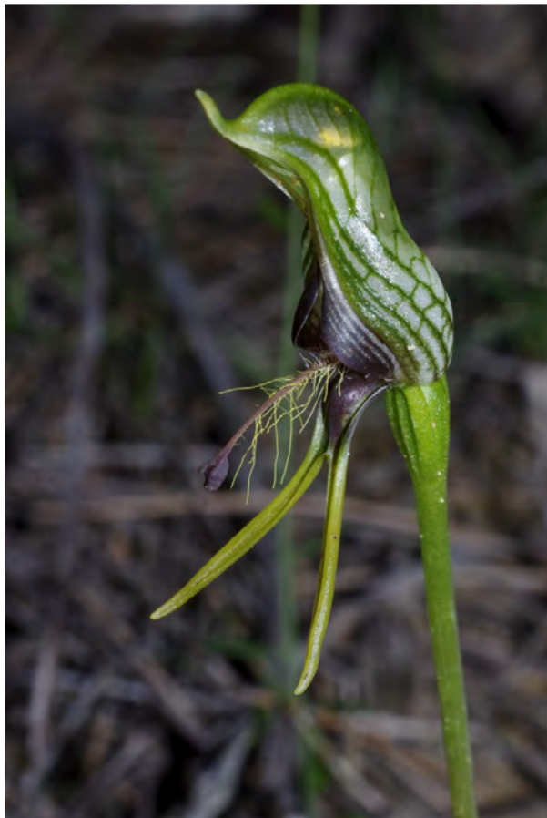
Pterostylis sp 'dwarf' - Dwarf Bird orchid