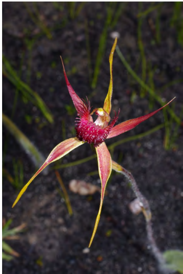
Caladenia decora – Esperance king spider orchid