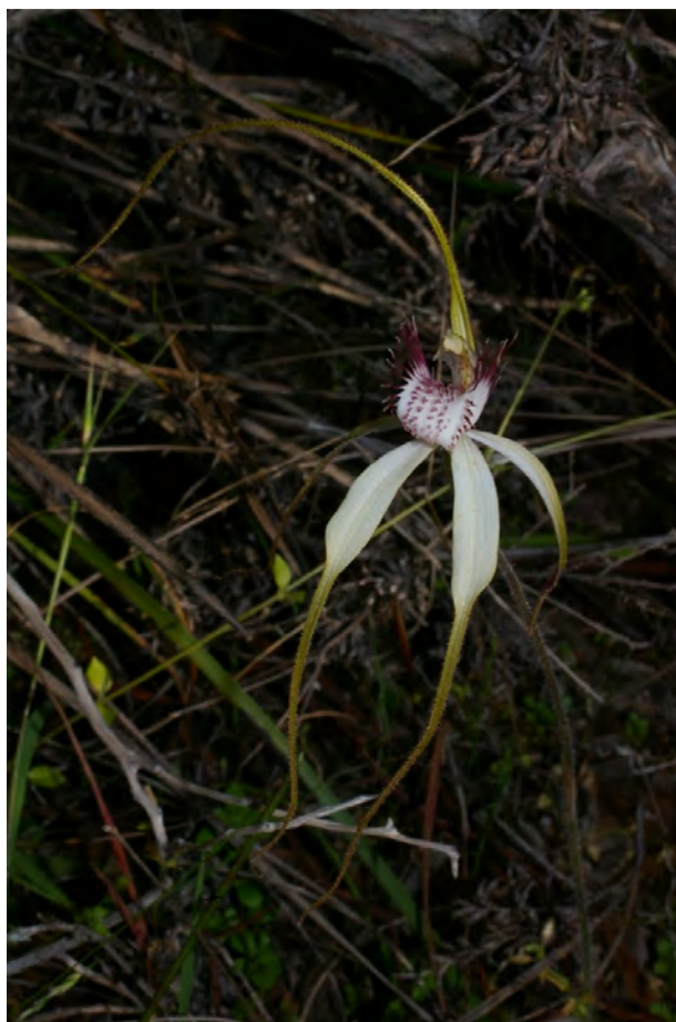
Caladenia longicauda subsp. australora – Southern white spider orchid