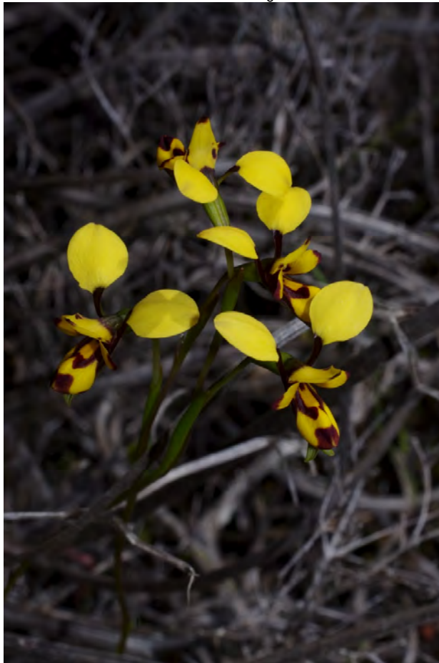
Diuris decremента – Common bee orchid