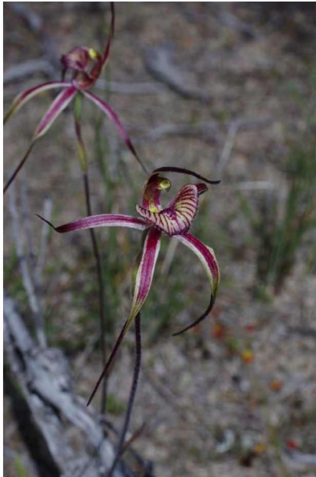
Caladenia roei hybrid