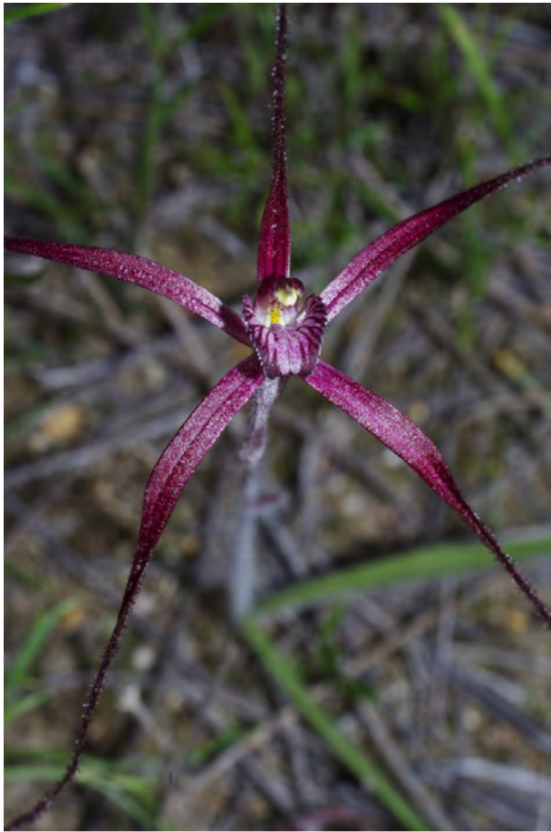
Caladenia pulchra – Slender spider orchid