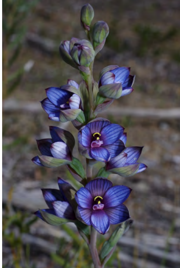
Thelymitra occidentalis – Western azure sun orchid