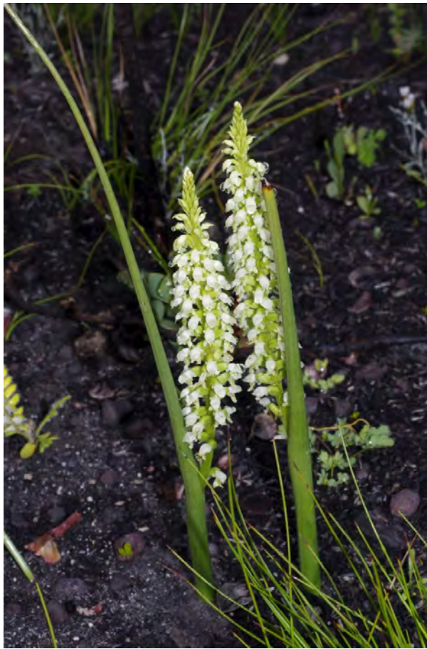
Microtis alba – White mignonette orchid