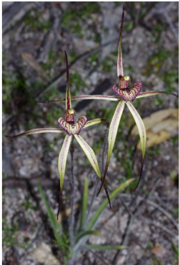
Caladenia roei hybrid