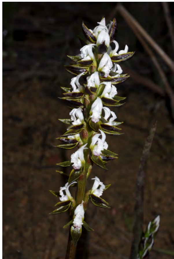
Prasophyllum sargentii - Frilled leek orchid