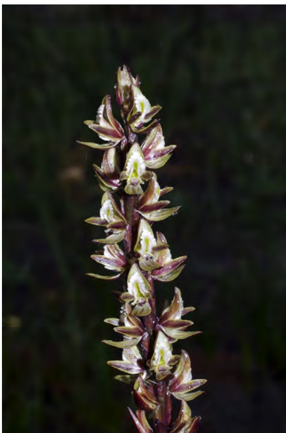
Prasophyllum elatum – Tall leek orchid