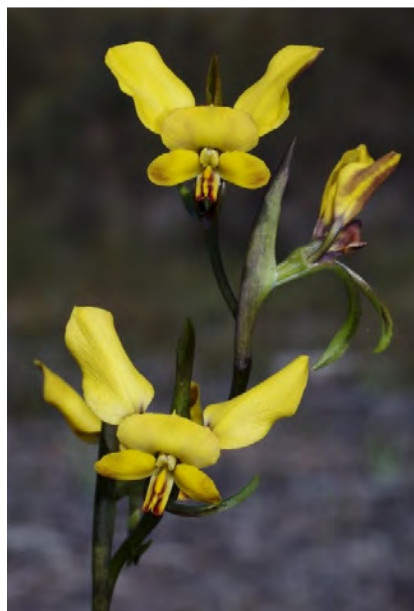
Diuris brumalis (Winter Donkey Orchid)