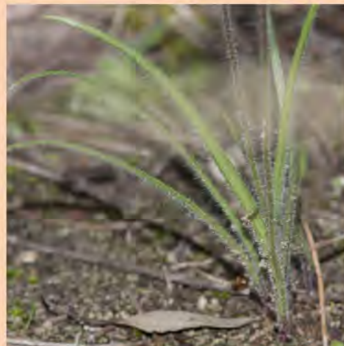
Caladenia dundasiae – Patricia's Spider Orchid – Priority 1