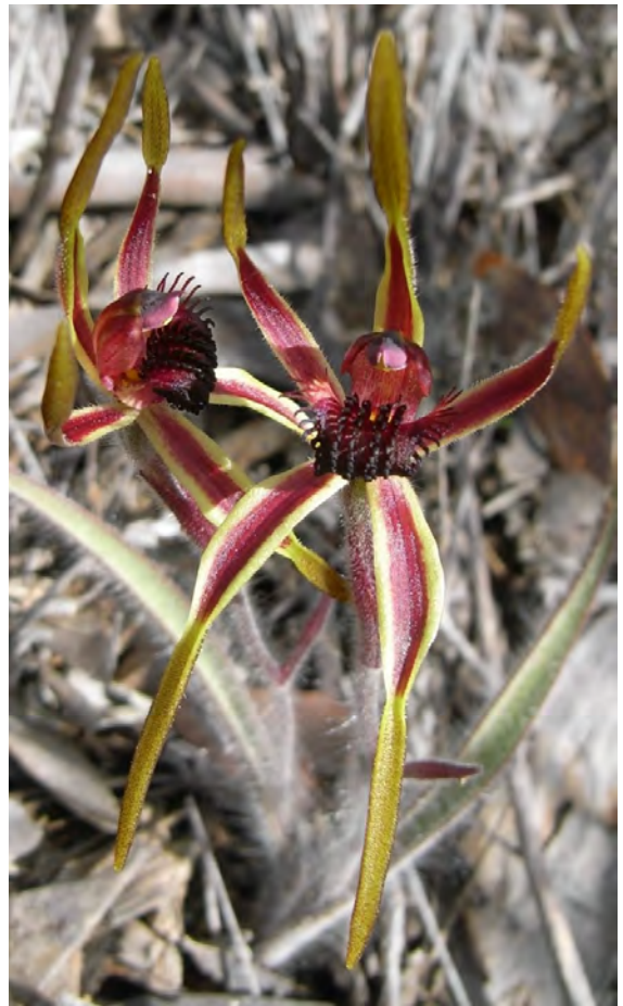
Caladenia arrecta (Reaching Spider Orchid)