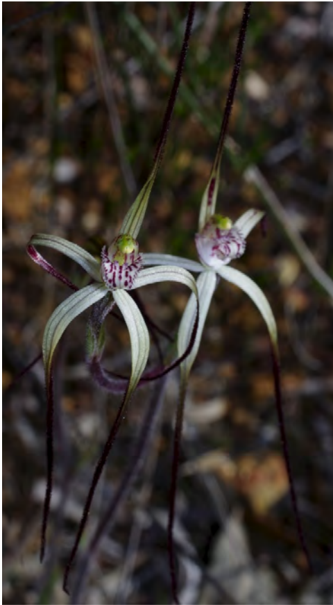
Spider Orchid Gillingarra