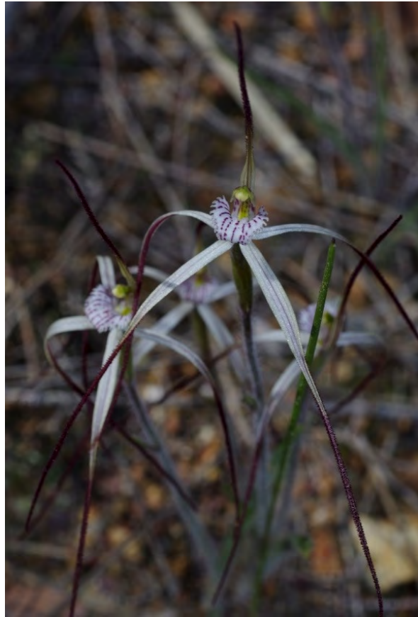
Caladenia exilis subsp. vanleeuwenii (Moora Spider Orchid)