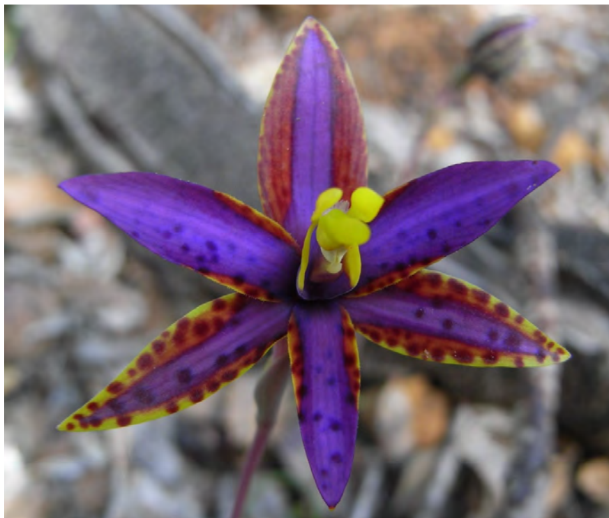
Thelymitra speciosa ( Eastern Queen of Sheba)