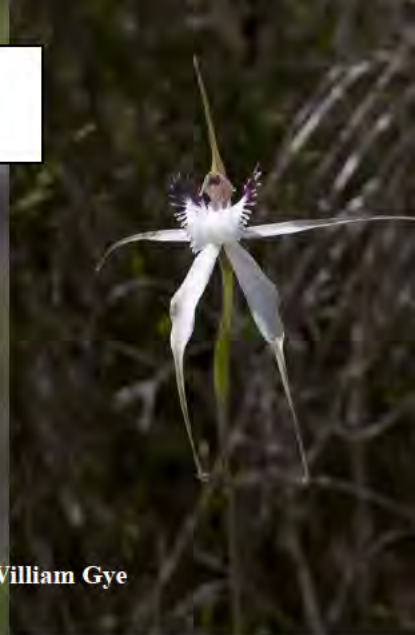
Spiders

There will be two starting times on the Saturday. This allows the large group to be divided evenly into two groups allowing for an early and a later starting time creating more flexibility participants coming from afar. We travel the same roads on the same day but at different times. Then on Sunday there is the option of returning the shorter route to Perth directly north from Walpole or west via Manjimup (not the official field trip) or the longer route via the South Coast Highway back towards Albany. People could peel off at numerous points if they did not want to travel all the way to Denmark/Albany.