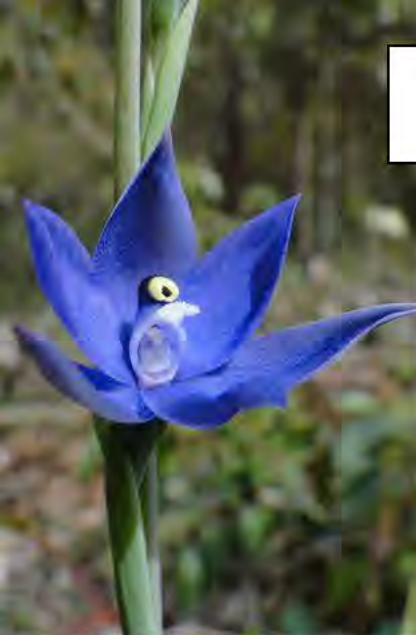
PHOTO COMPETITION – 16 th Nov 2011 Please bring 3 standard post card size photos – of white, red or pink and blue orchids. (One of each colour)