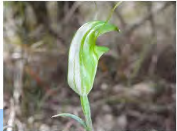
In a burnt area at Kurri flowering plants of Ptst. acuminata , Ptst. reflexa (below) and Ptst. parviflora var. parviflora were observed.

Myuna Bay had numerous orchid leaves appearing including Acianthus , Pterostylis , Thelymitra and a late spike of Cryptostylis subulata which had just withered, as well as several flowering plants of Ptst. Obtusa (below).