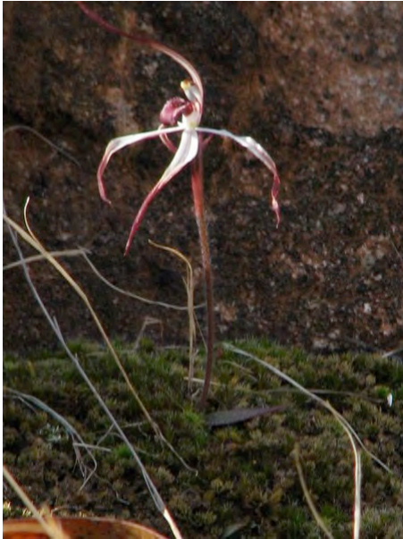
C. drummondii in moss on rock