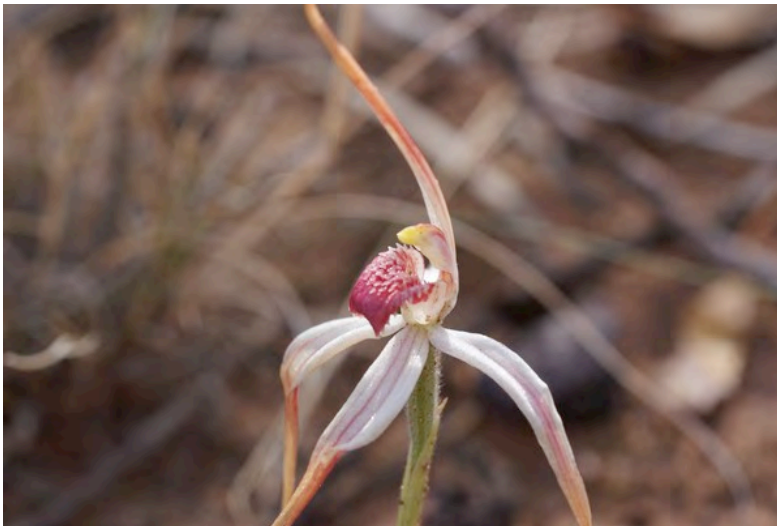
'Pale' C. drummondii