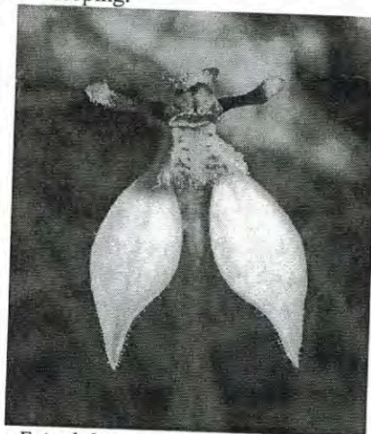
Eriochilus cucullatus (Pink)

The recognitor also located two different flowering species. These being a couple of flowers of the pink form of Eriochilus cucullatus and a couple of inflorescences of Acianthus exsertus . The colonies of Acianthus exsertus leaves probably numbered in the hundreds but only a couple of plants had open flowers. A handful more plants had inflorescences developing.