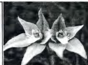
C flava subsp flava

Registered by Australia Post Publication No WBH 1240