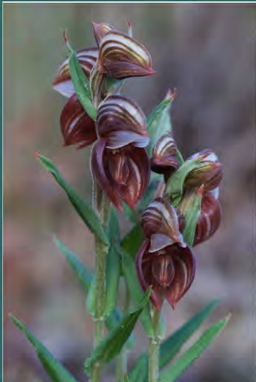
Pterostylis concava , Boyup Brook. Close-up of the same plant on the back page