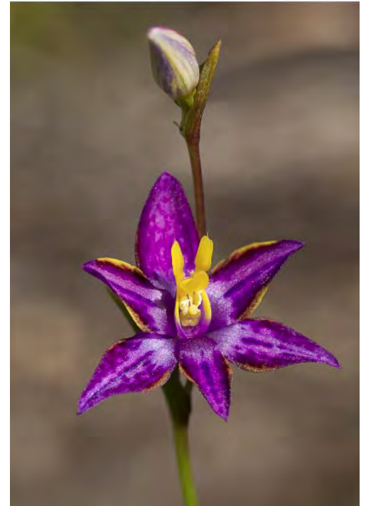
Thelymitra apiculata.