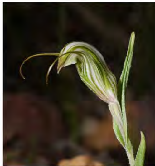
CCW from left: Pterostylis scabra , Pt. vittata , Caladenia drummondii .