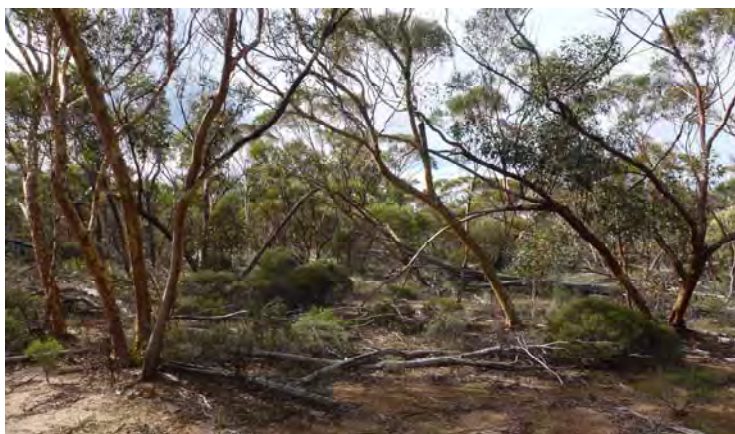
Caladenia drummondii (flowers) and typical habitat. Also on p.3.