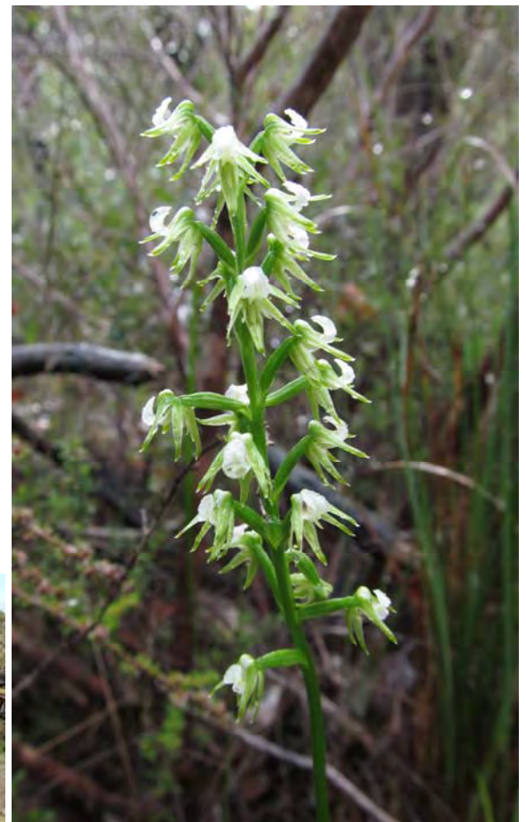
Prasophyllum sp. ‘early’. Photo by B. Masters < May 15 Field trip. Photo by C. Rowan