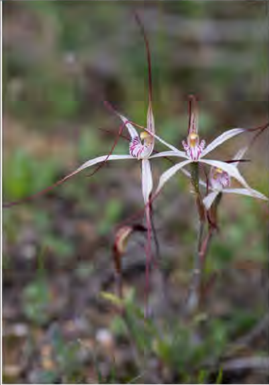
Caladenia vulgata from Darlington.