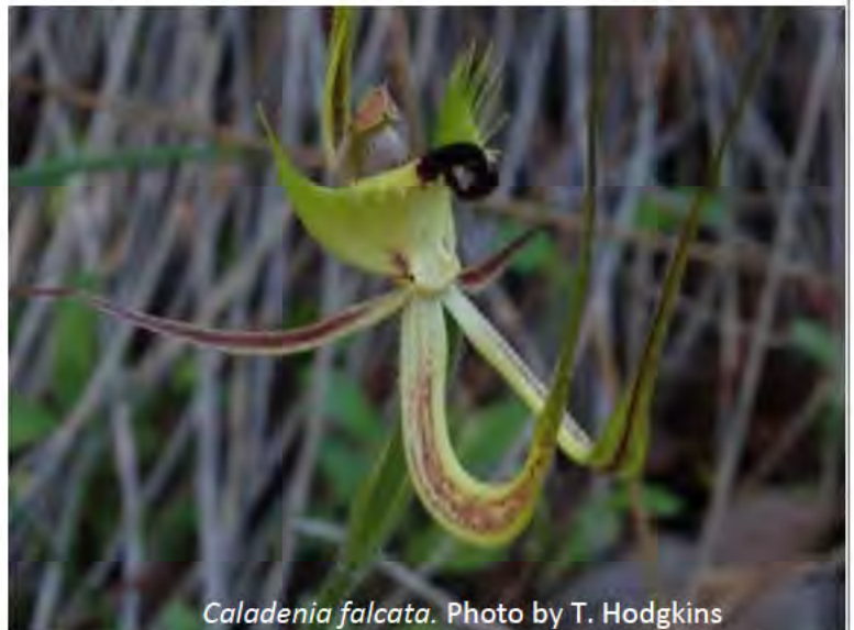
Caladenia falcata.

As a resident of Greenwood I have been within walking distance of this bushland reserve for over 40 years but have only discovered it in the last 10 or so years. This came from a chance meeting with a friend who knowing my interest in native orchids pointed out the Pterostylis nana (snail orchids) that