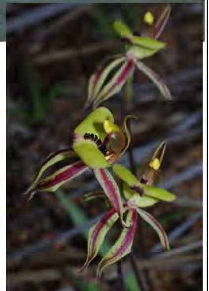
Clockwise from above: Caladenia saxicola flower and close-up, road conditions west of Bullfinch, Caladenia roei , Pterostylis rufa rosette.