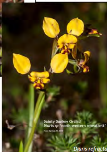
Dainty Donkey Orchid Diuris sp 'north-western wheatbelt'