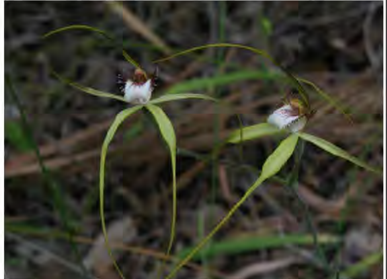
Caladenia swartsiorum .

C. ambusta C. bigeminata C. perangusta C. swartsiorum C. validinervia C. erythronema C. longicauda subsp extrema C. longicauda subsp minima