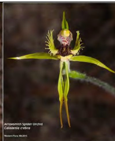
Arrowsmith Spider Orchid Caladenia crebra Western Flora WA 2015