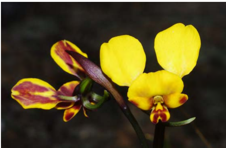
L-R: Diuris hazeliae , Pterostylis sp. 'inland' , Pt. mutica .

We had noticed some low rocks on the side of the highway as we passed on the way to Karalee, so stopped on the way back to have a look around. Here we were excited to find the target orchid, Caladenia saxicola in good numbers under Thryptomene bushes on the edge of the rocks. We also found Caladenia roei and Pt. sp. 'inland' in flower; and most of the other previously seen species in leaf or bud. We tentatively ID Caladenia mesocera in bud also.