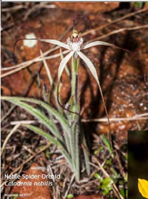
Noble Spider Orchid Caladenia nobilis