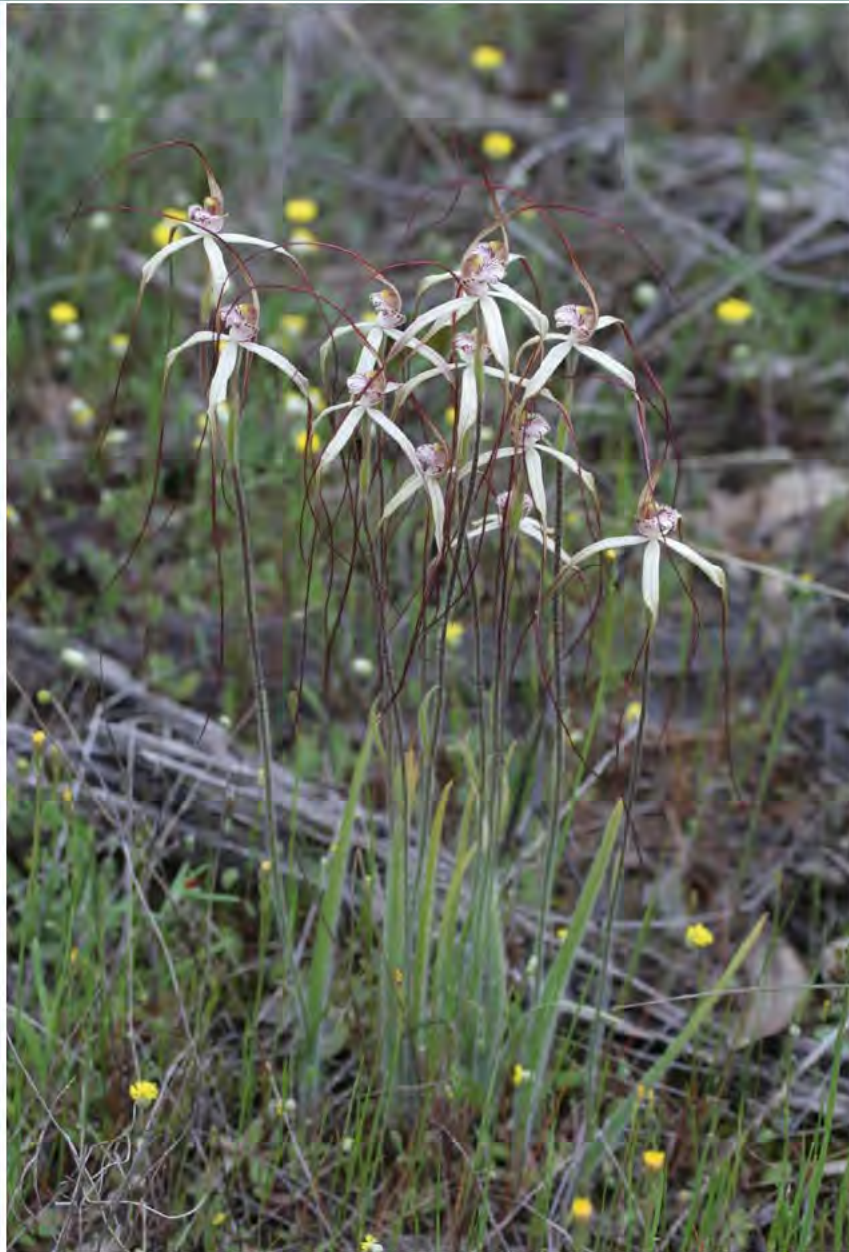
Unknown species of wispy spider orchids.