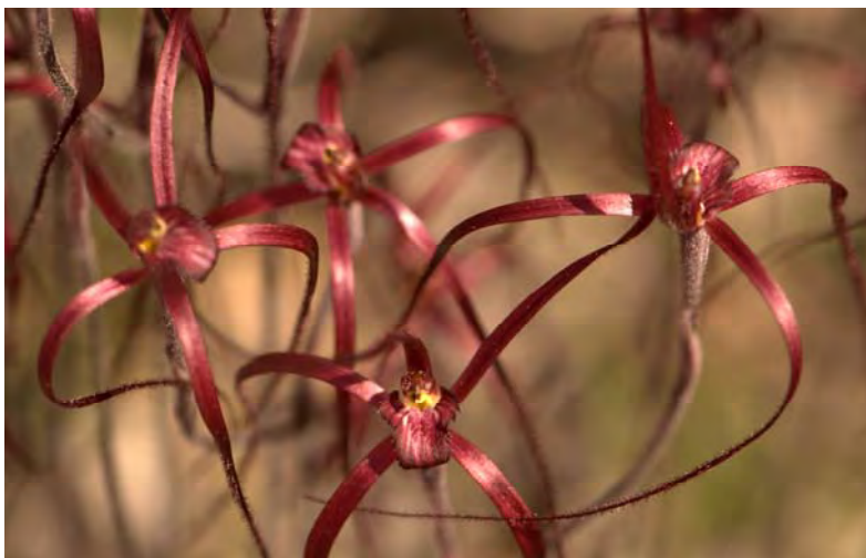
Caladenia filifera.