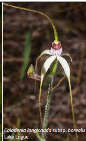
Caladenia longicauda subsp. borealis Lake Logue