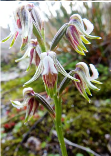
Thelymitra speciosa , T. spiralis , Prasophyllum parvifolium .