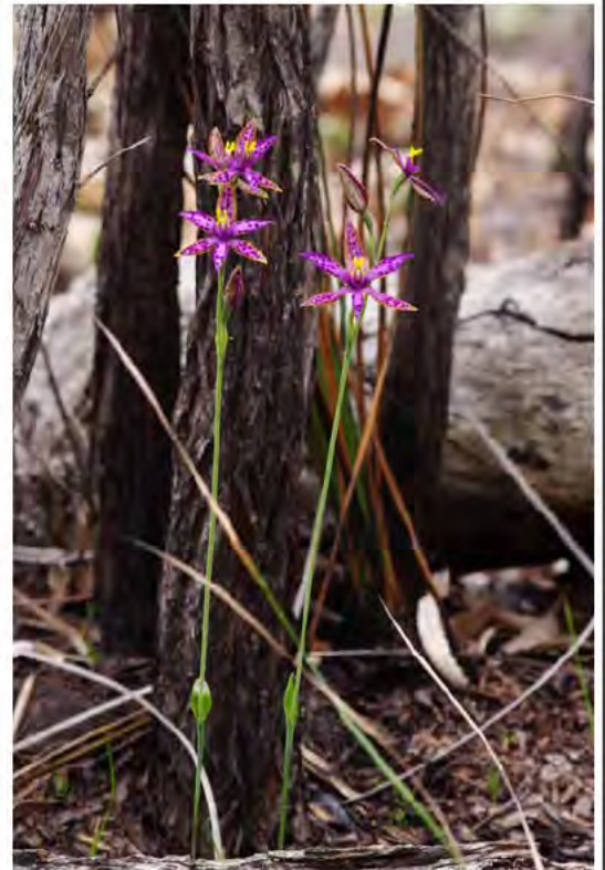
T. variegata (coastal form).

Some may not realise that this species is also known from two forms, an early flowering late June-July form that often has pale flowers and a mid August-early September form with often more colourful flowers. We would like to hear about locations of either of these forms, particularly the early form which has not been seen for some years.