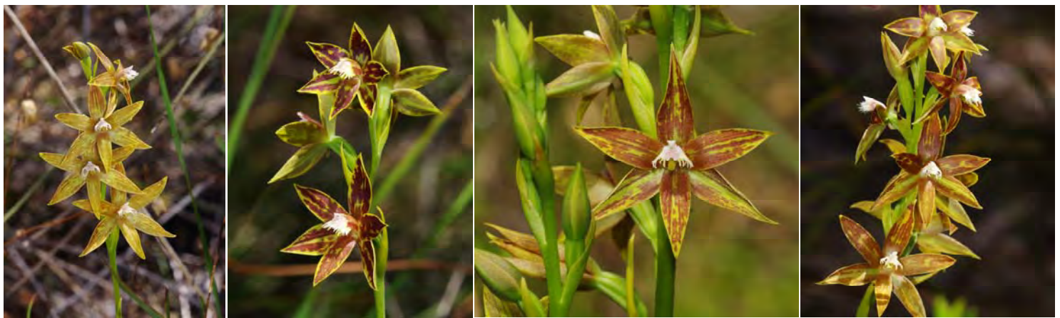
Variety of coloration of Thelymitra fuscolutea from Warwick bushland .

Warwick bushland is well worth a visit and has many distinct walking paths throughout the whole area.