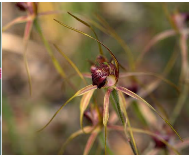
Caladenia arenicola.