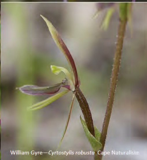
Cyrtostylis robusta Cape Naturaliste