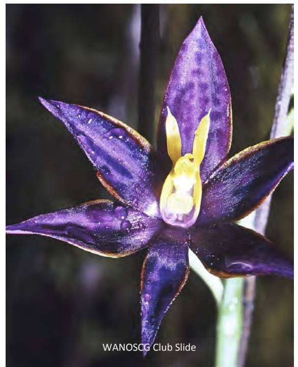
WANOSCG Club Slide

Other trips in October are still in the planning stage and full details will appear in future bulletins.