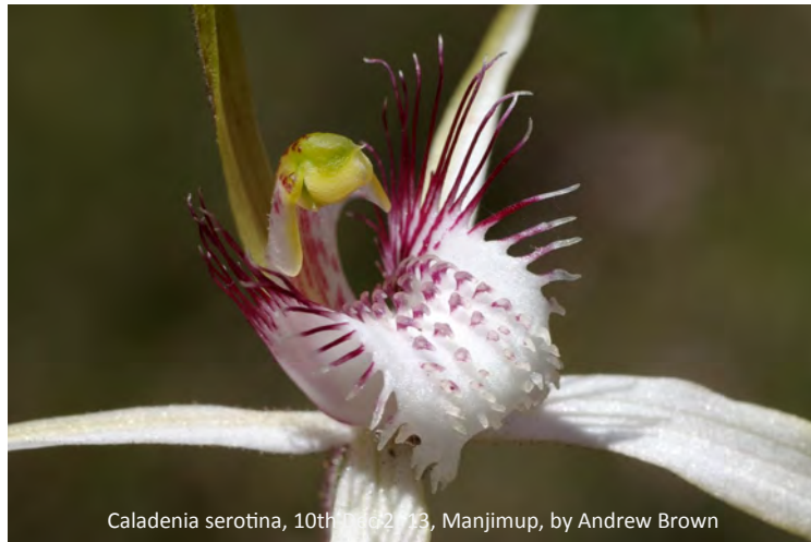
Caladenia serotina, 10th Dec 2013, Manjimup