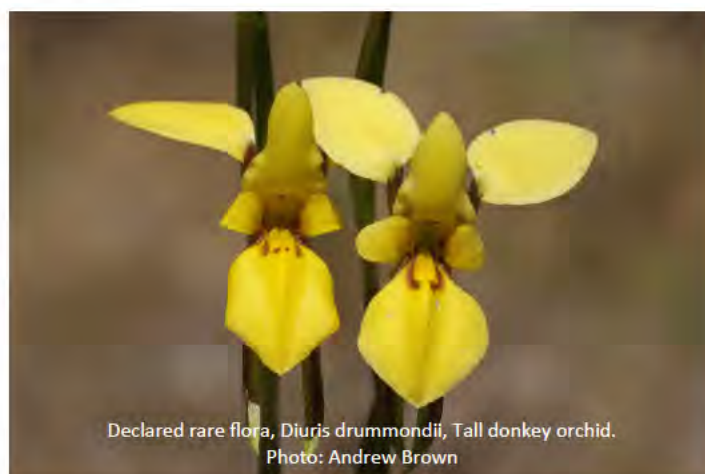
Declared rare flora, Diuris drummondii, Tall donkey orchid.