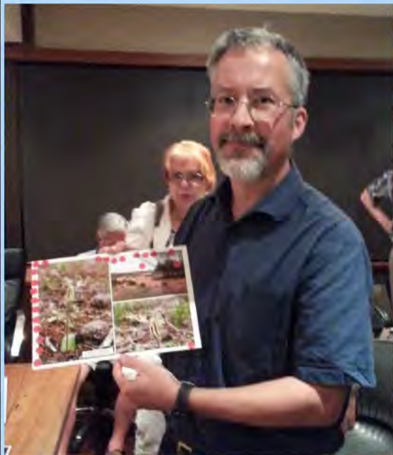
Photo Competition November 2013

A decision about the nature of the photo competition is yet to be made. Members are asked for their ideas for this our 40 th year.