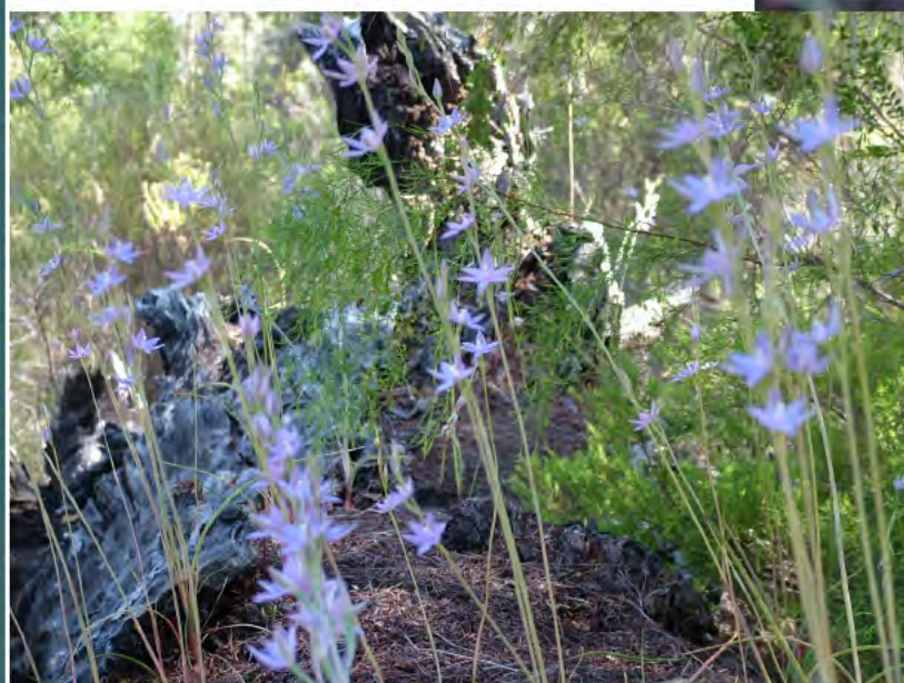
An unusual display of 85 Thelymitra paludosa flowering on a huge rotting Marri log in November near Denmark. Some were 80+ cm in height and flowered for 3 weeks