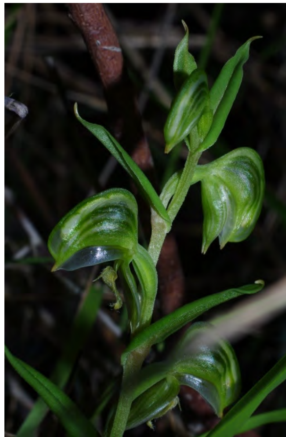
Pterostylis vittata – Banded Greenhood