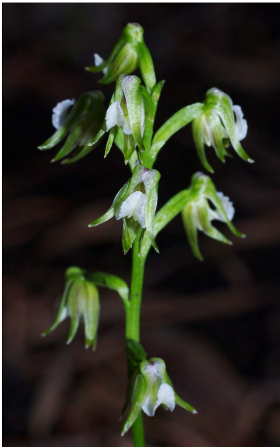
Prasophyllum sp. 'early' - Scented Autumn Leek