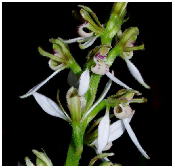
Eriochilus dilatatus subsp. magnus flowers