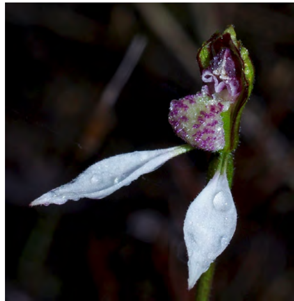
Eriochilus helonomos – Swamp Bunny