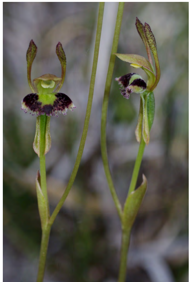
Leporella fimbriata – Hare Orchid