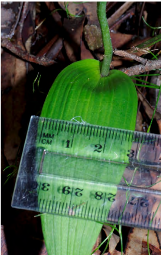
Eriochilus dilatatus subsp. magnus leaf width