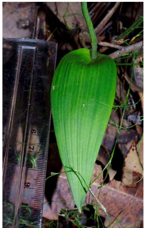
Eriochilus dilatatus subsp. magnus leaf length