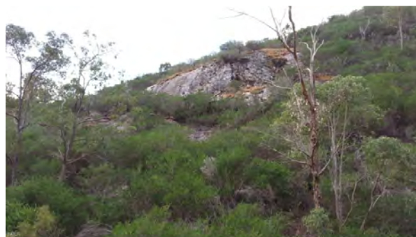
Granite outcrop in Ellis Brook Valley Reserve

the south facing sides retain the moisture from early autumn rains better? Armed with this idea I scouted around on Google Maps on the internet ( https://maps.google.com.au/ ), swapping between satellite and terrain views looking in the Darling Scarp. I spotted several likely locations in Bill Dewhurst Reserve (Mills Rd East), Ellis Brook Valley Reserve (Rushton Rd) and Lesmurdie Reserve (Welshpool Rd East). At each location I found various Eriochilus in bud or flowering and only on the south facing outcrops. My problem now is identification!