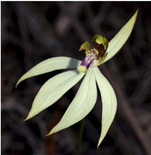
Praecoxanthus aphyllus – Leafless Orchid