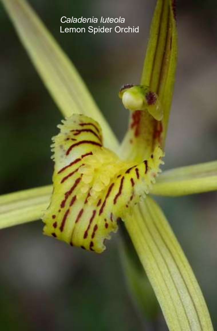
Caladenia luteola Lemon Spider Orchid

southeast. For old records it is best to just go by the locality information provided on the label (although often scanty) and search any suitable habitat in that area. For more recent collections the GPS info will be more accurate but even then the person may have walked in 100 m and found the orchid and then returned to the car to take a GPS reading.