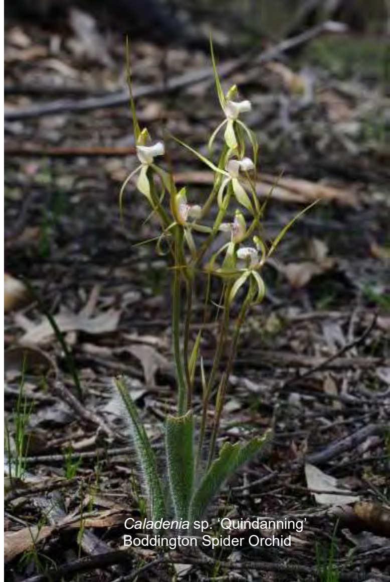
Caladenia sp. 'Quindanning' Boddington Spider Orchid