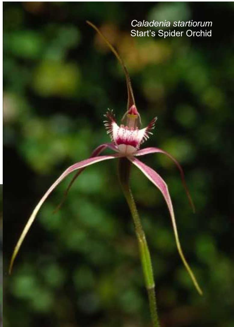
Caladenia startiorum Start's Spider Orchid