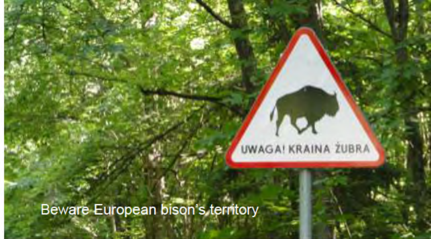
Beware European bison's territory

The Park established in 1932 is one of the oldest nature reserves and known for its virgin forest with wonderful fauna and flora but most of all for being the home of European bison. The Białowiecki National Park is on the UNESCO list of World Biosphere Reserves and on the UNESCO list of World Heritage. We were lucky to see there 2 different kinds of orchids.