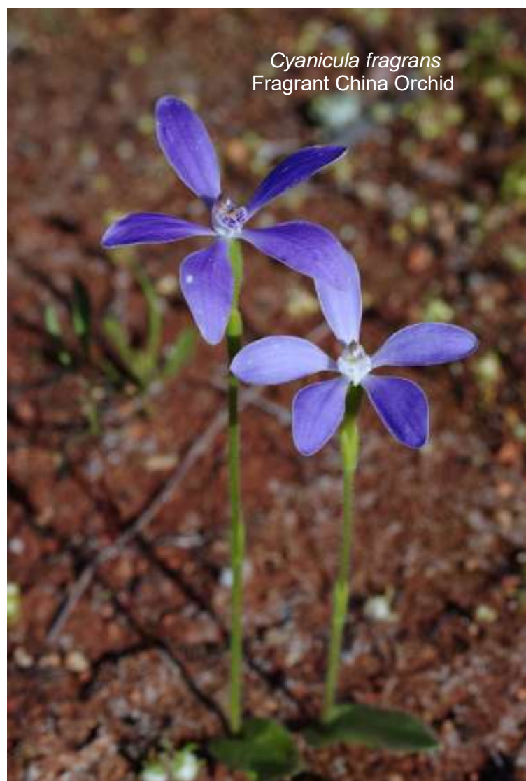
Cyanicula fragrans Fragrant China Orchid

The Adopt an Orchid project was born out of the West Australian Native Orchid Study and Conservation Group's (WANOSCG) desire to assist DEC in obtaining better and up-to-date population, threat and survey information for priority orchid species. This way, DEC can be more certain of their conservation status,