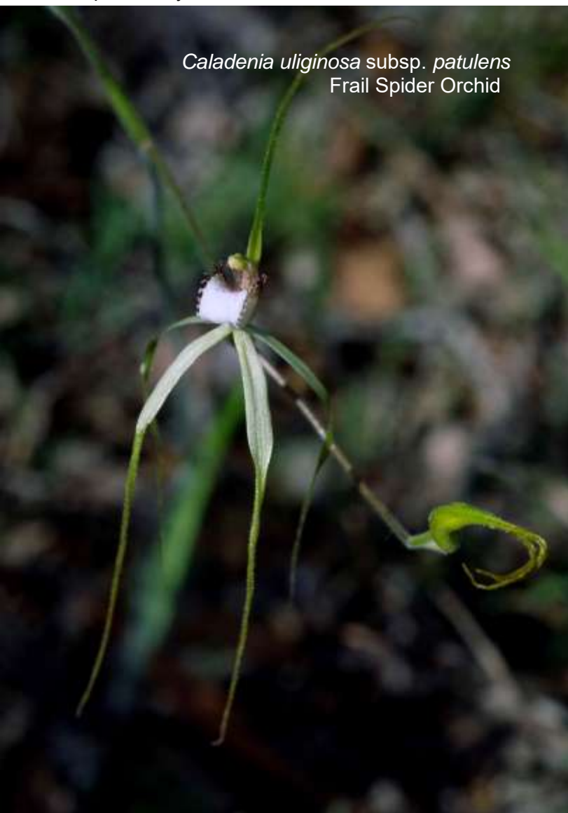
Caladenia uliginosa subsp. patulens Frail Spider Orchid