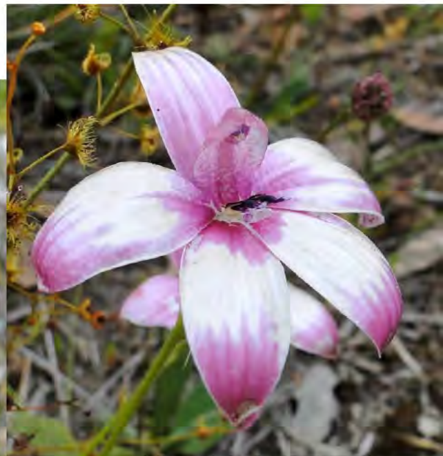
Site 3: Kulunilup Lake: Elythranthera emarginata (Pink Enamel Orchid), some having bleached by sunburn from the previous hot days, which made them look bi-coloured. Several Caladenia radiata