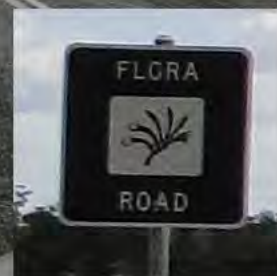
Photo shows the recent clearing along Robinson Road Woodanilling which is supposed to be a Flora Road.

This information can be used to advise Shires before road verges clearings take place.