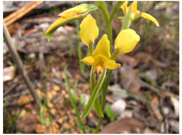
Beautiful Diuris parryi at Frankland.