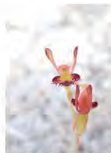
Leporella – Hare