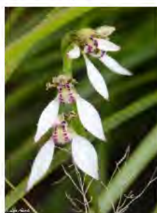
Eriochilus dilatatus – White Bunny Orchid