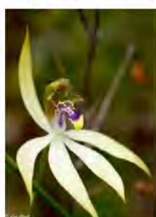
Praecoxanthus – Leafless Orchids